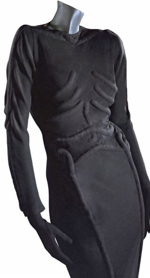
Schiaparelli's Skeleton Dress