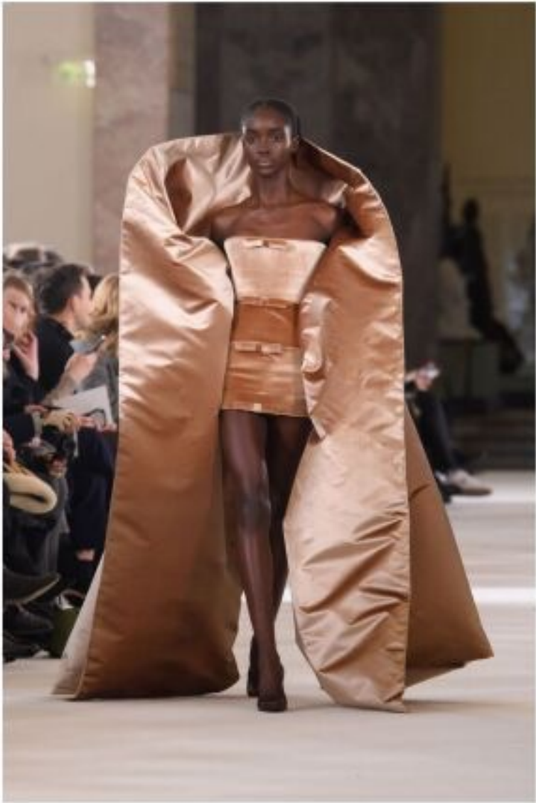
SCHIAPARELLI SPRING/SUMMER 2023 COLLECTIONS