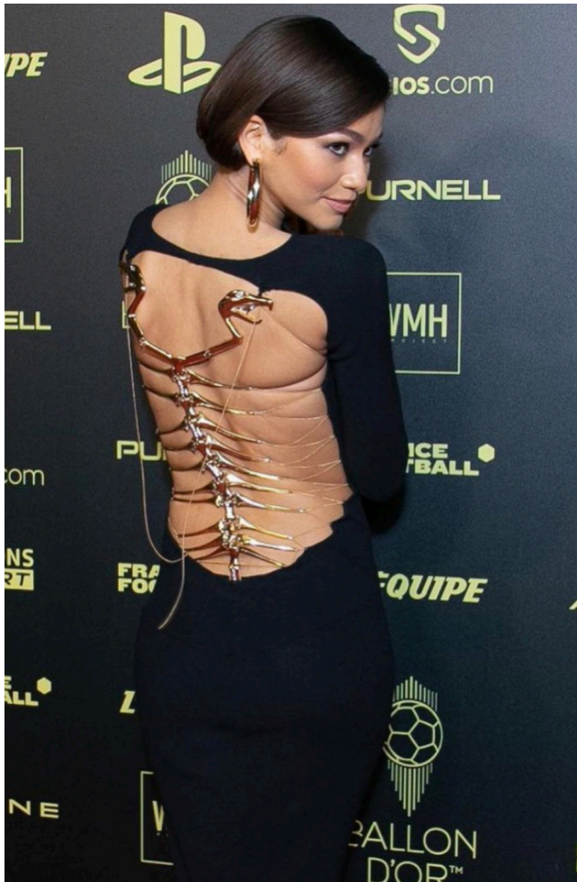
Roberto Cavalli Fall/Winter 2000 Gold Metal Spine Dress (2021).