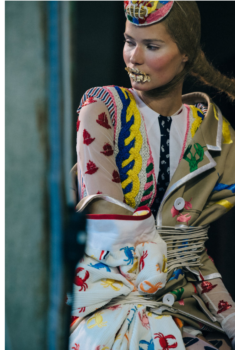
Thom Browne's 2018 show Bind Me Up Set Me Free