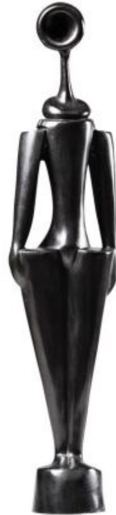
MAX ERNST, LA PARISIENNE , 1950