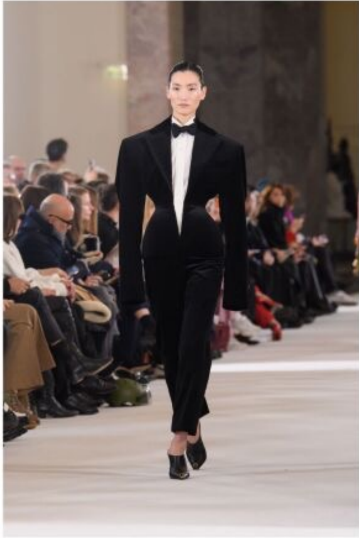
SCHIAPARELLI SPRING2023 COLLECTION