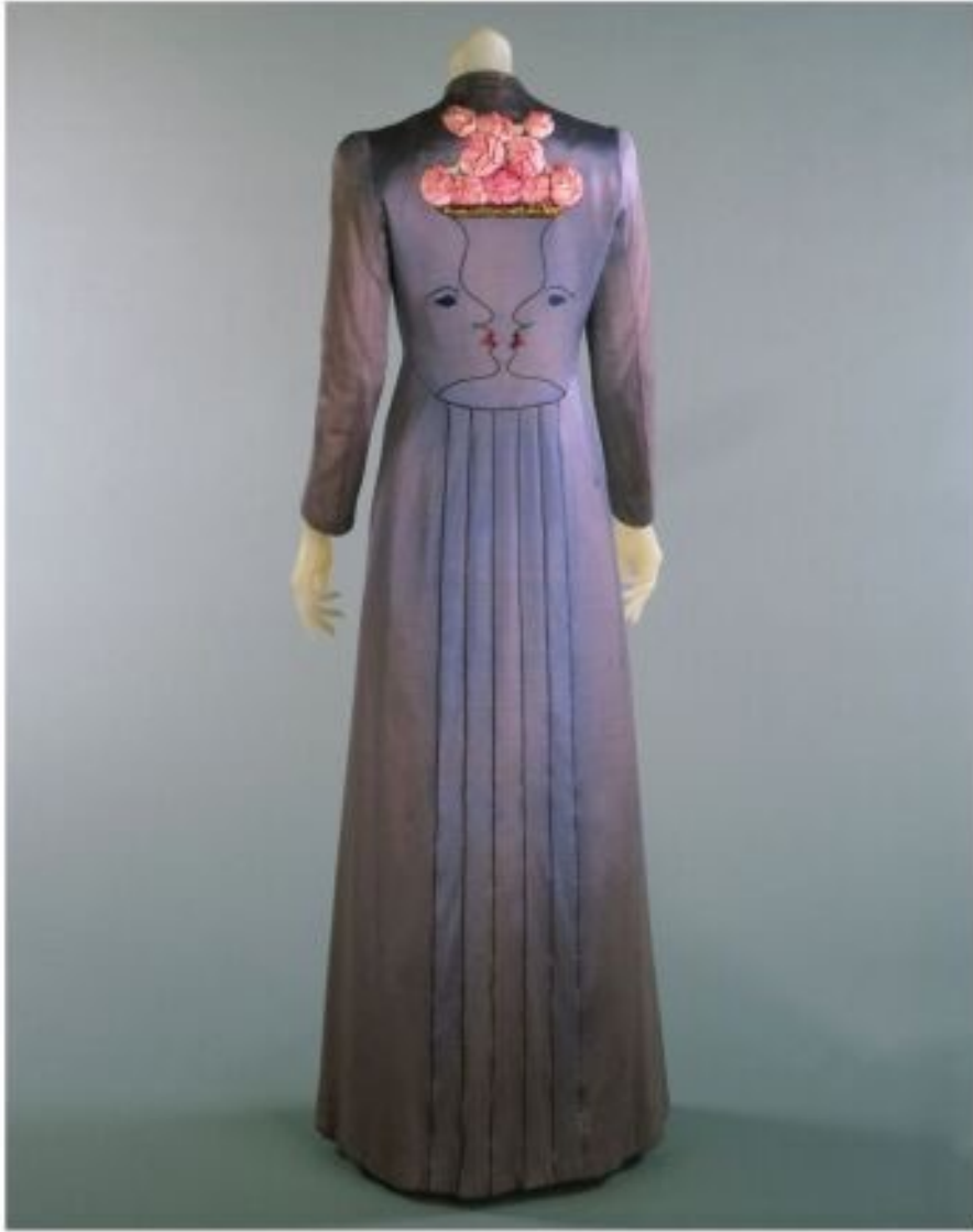
ELSAA SCHIAPARELLI AND JEAN COCTEAU, EVENING COAT , 1937