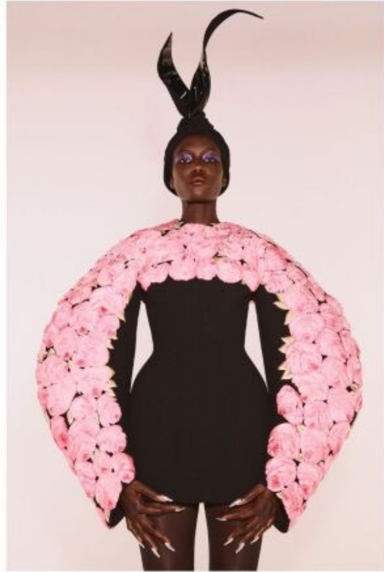
SCHIAPARELLI HAUTE COUTURE, FALL/WINTER 2021, MINI DRESS